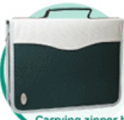
Carrying zipper bag